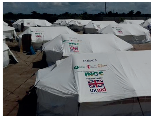
From left: a new building in Central Zimbabwe; feeding the hungry in Masvingo; temporary shelter in Manicaland.