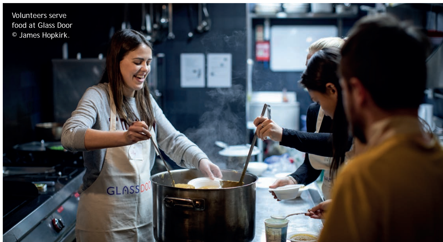
Volunteers serve food at Glass Door.

Isaiah 55:1-9, 1 Corinthians 10:1-13, Luke 13:1-9