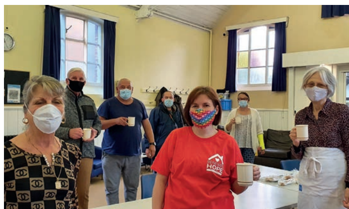
Volunteers prepare for a night shift at Croydon Nightwatch (top) and for a day helping at Renewed Hope, Redhill (above).

Loving and saving God, we thank you that you have given us a home with you in heaven, help us work to enable others to feel at home in our communities. Give us your generosity of spirit that we might work with our neighbours to bring hope and peace to those around us. Amen.